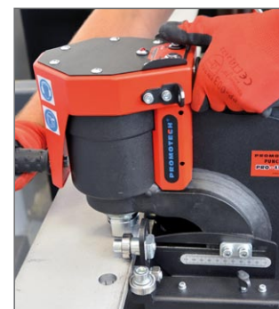
Wheel puncher slide