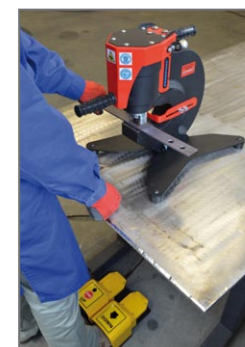
Bench top stand with foot pedal